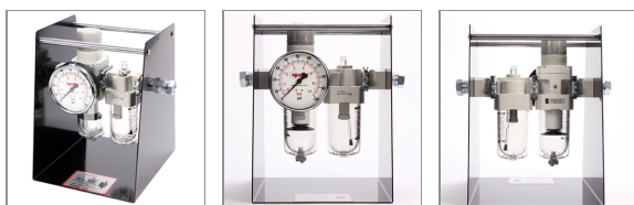
Lubro Control Unit