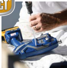
1. Remove the cover with a screwdriver.