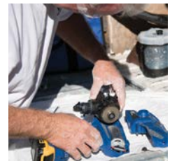
3. Place the new pump into sprayer.