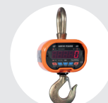
CRANE SCALES GPJ MODEL Pag. 79