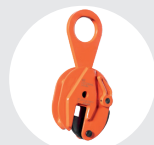
SIMPLE POSITION CLAMPS B MODEL Pag. 51