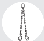
SLING "DOL" Pag. 90