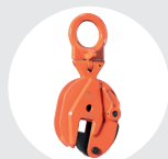
MULTIPOSITION CLAMPSBT MODEL Pag. 50