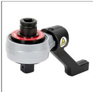
HandTorque HT3 2700 N·m Kit