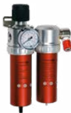
4220PLUS Ref. 10750402