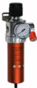
4120PLUS Ref. 10730502

Extremely smooth operation, maximum precision. Fast release, instant decrease in pressure. Air-assisted regulator. Constant and regular air supply. Aluminium bodies. CNC mechanisation. Totally robust. Unattended evacuation of liquids and impurities.