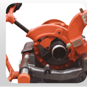
THE CUTTER (Cutting)