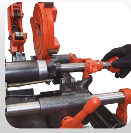
THE REAMER (Reaming)

IMPORTANT: Never use liquid coolants or other water based products. Only threading cutting oil should be used.