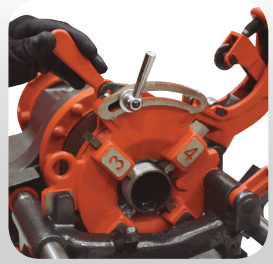
THE THREADING DIES (Threading)